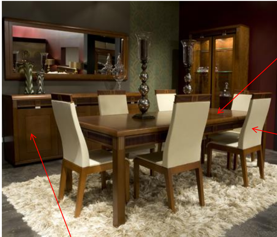
FF-05 – Dining Table Size -2250 x 1000 mm