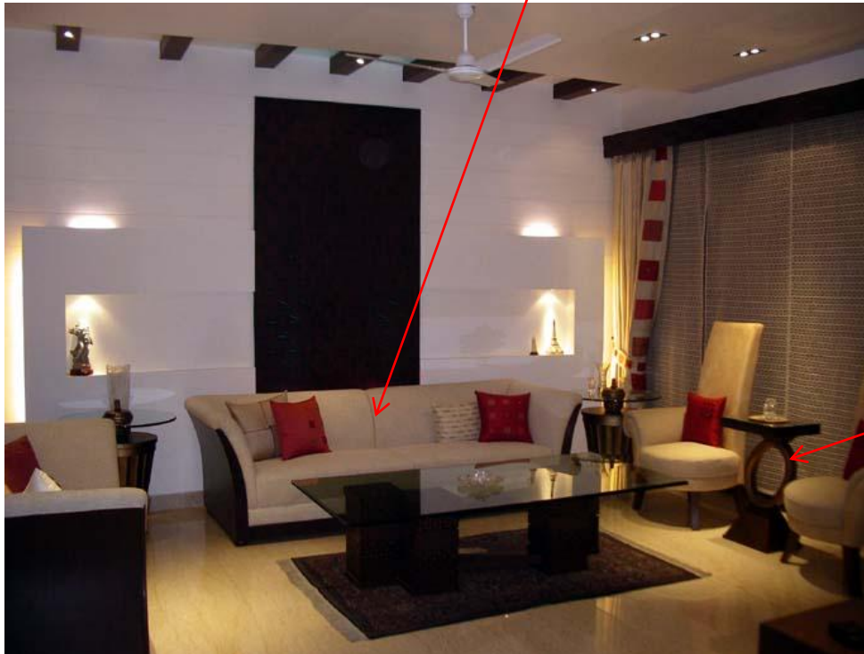
FF-01 – Drawing Room Sofa Size -2350 x 825mm